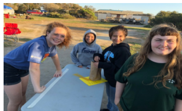
Above: Board members working on the marshmallow tower challenge

On the weekend of September 22-23 the Loma Vista 4-H Club Officers went on a leadership team building campout retreat at McGrath State Beach Campground in Oxnard. During the event, the officers took part in a number of fun, team building exercises to strengthen the working