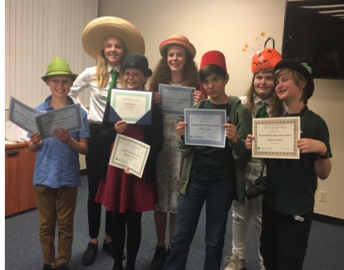
Above: Loma Vista 4-H'ers at Ventura County 4-H Achievement Night

this was revealed, members playing the game then played an incredibly competitive tiebreaker.