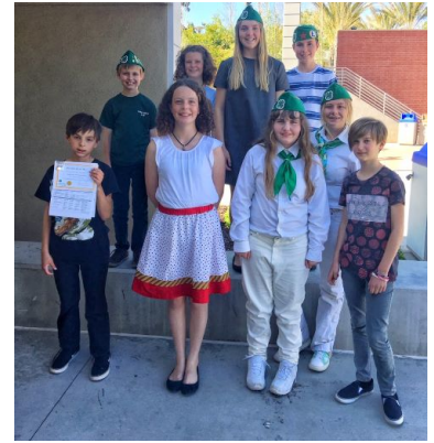
Above: Group Photo of Loma Vista 4-H Club Members at Southern Area 4-H Field Day, 2017.

The presentations mentioned above are just a few of the presentations you can perform in the California 4-H Program. Although it may seem daunting at first, anyone can succeed with presentations in 4-H. For more information about 4-H Presentations, feel free to visit the California 4-H Presentation Manual at: http://www.ca4h.org/files/2193.pdf . Also, the 4-H Record Books and Presentations Practice Project is still accepting new members. The project is unlimited, and meets at the Poinsettia Elementary School one hour before each club meeting at 6 p.m. on the second Tuesday of each