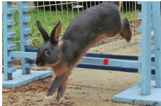
Above: Adult Tan rabbit participating in rabbit hopping

The project also encourages its members to take part in various competitions. Members in the Rabbits Project can do showmanship with their rabbits at the Santa Barbara Fair, Ventura County Fair, Small Animal Field Day, and other rabbit shows. At some of these same events, they can also participate in rabbit hopping competitions.